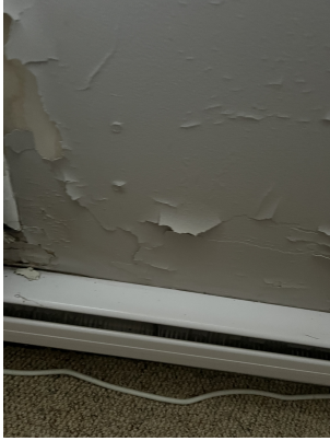
Hazard: Bedroom 1 | Wall | Deteriorated Paint