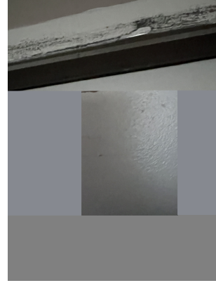
Hazard: Bedroom 1 | closet door | Deteriorated Paint