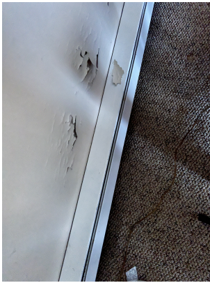
Hazard: Living Room | Wall | Deteriorated Paint

Lew Environmental Services - 807 Eves Drive -Visual Inspection