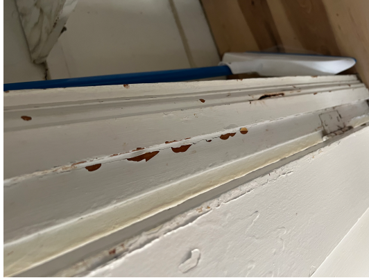
Hazard: Kitchen | Closet Door Frame | Deteriorated Paint

Lew Environmental Services - 716 Nassau Street -Visual Inspection