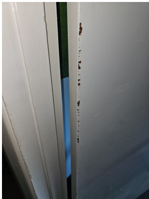
Hazard: | |