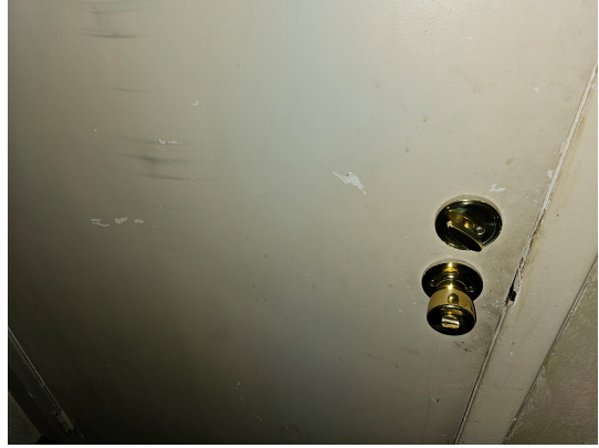
Hazard: Living Room | Door | Deteriorated Paint