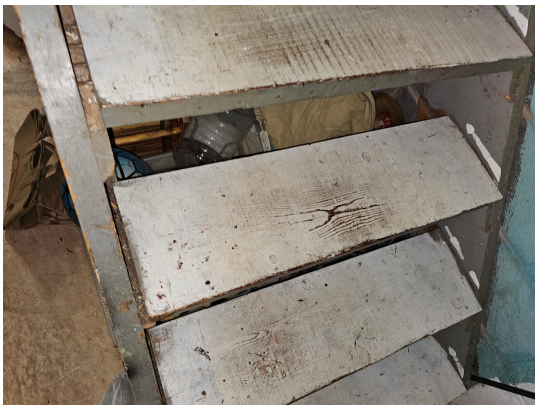
Hazard: Basement | Steps | Deteriorated Paint