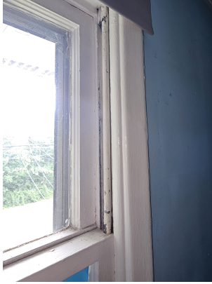
Hazard: Bedroom 1 | Window Track | Deteriorated Paint