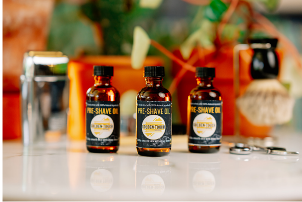
Hazard: Foyer | Baseboard | Deteriorated Paint

Low Environmental Services - 55 WEST SOUTH ORANGE AVE -Visual Inspection Prepared By: LEW Environmental Services, LLC 02/05/2024