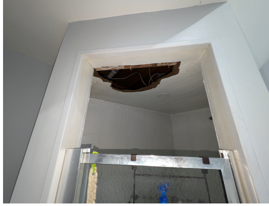
Hazard: Bathroom | Ceiling | Deteriorated Paint

Low Environmental Services - 4 walnut rd -Visual Inspection Prepared By: LEW Environmental Services, LLC 07/03/2024