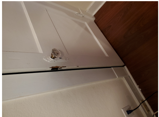
Hazard: Bedroom 3 | Door Casing | Deteriorated Paint