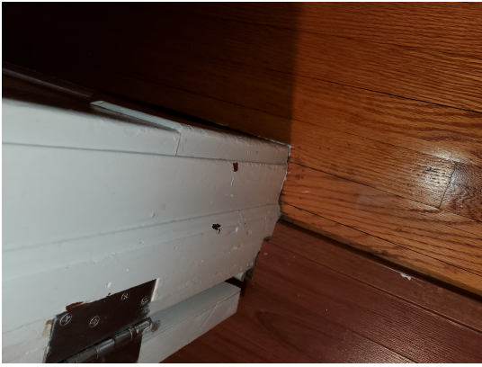
Hazard: Hallway 1 | Door Casing | Deteriorated Paint

Lew Environmental Services - 439 Boonton Ave -Visual Inspection Prepared By: LEW Environmental Services, LLC 12/19/2023