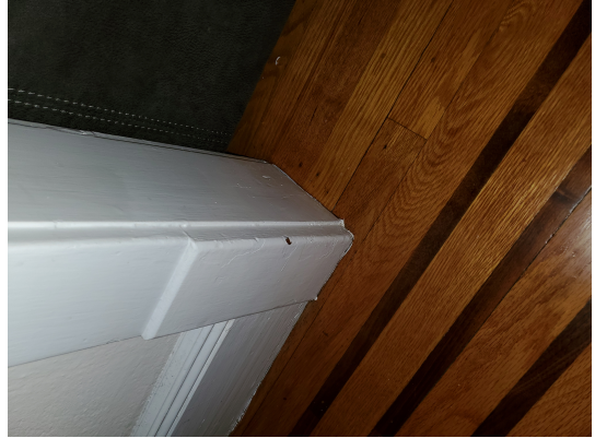
Hazard: Dining Room | Door Casing | Deteriorated Paint