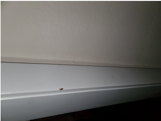
Hazard: Dining Room | Door Casing | Deteriorated Paint