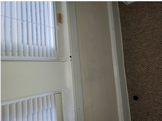
Hazard: Sun Room | Window Sill | Deteriorated Paint