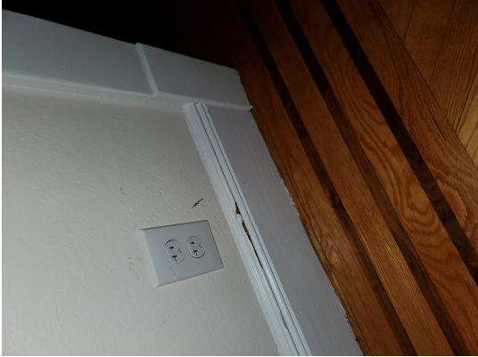
Hazard: Dining Room | Baseboard | Deteriorated Paint