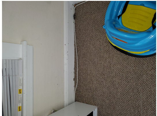
Hazard: Sun Room | Baseboard | Deteriorated Paint