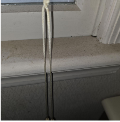
Hazard: All Rooms | Window Sill | Dust