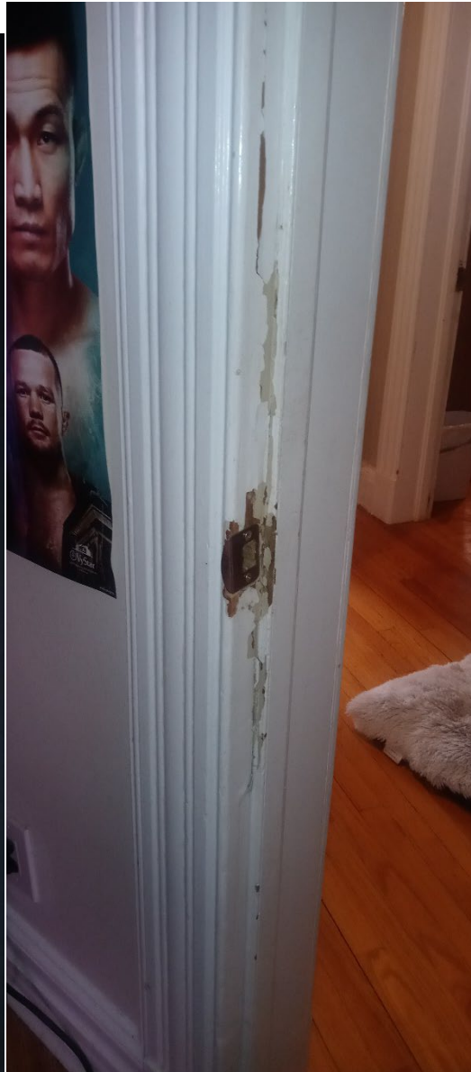
Bedroom 3 Door Jamb