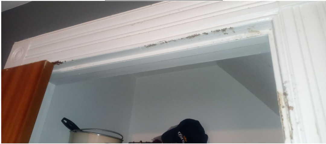
Bedroom 1 Closet Door Jamb and Casing