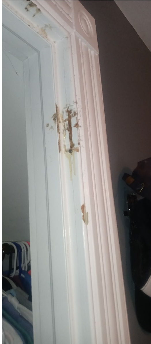
Bedroom 1 Closet Door Jamb