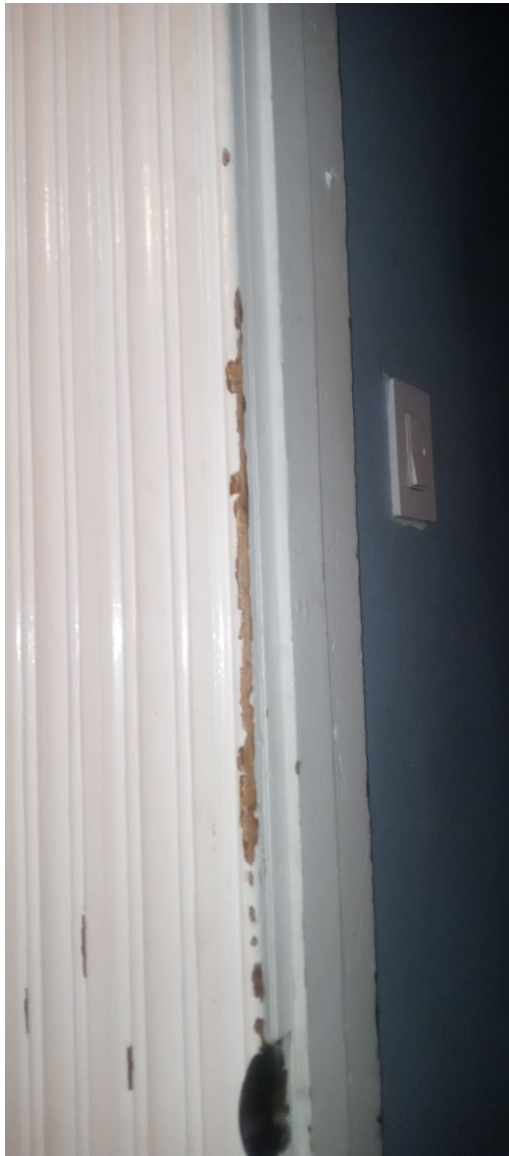
Hall 1 Door Casing Wall B (Attic Door)