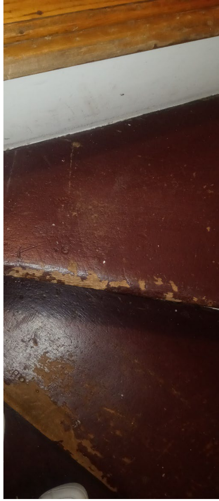
Foyer Stair Treads