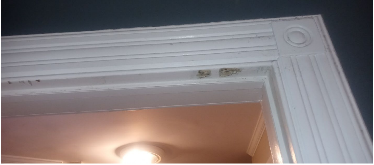
Bedroom 1 Door Jamb