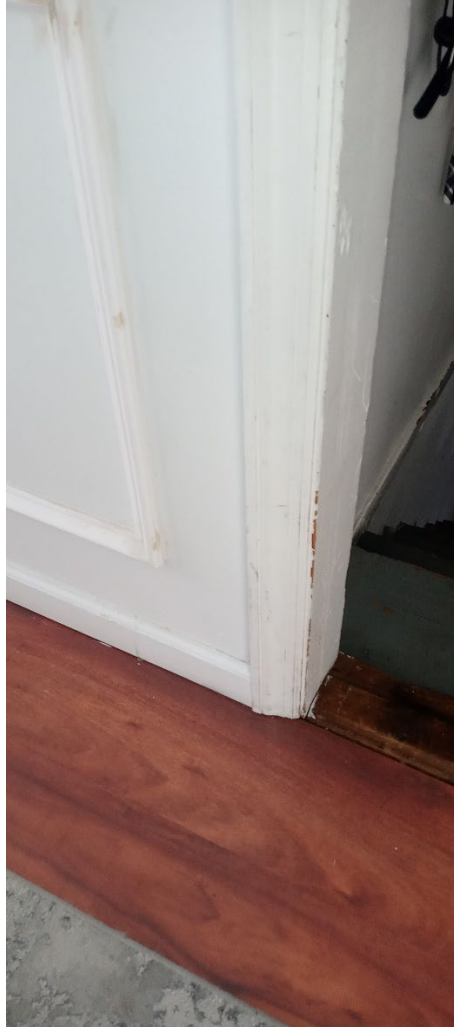
Hall Door Casing Wall A