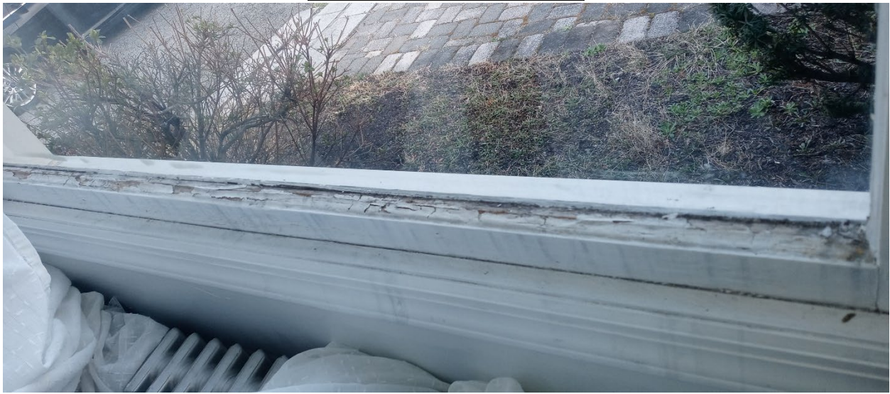
Living Room Window Sash Wall A