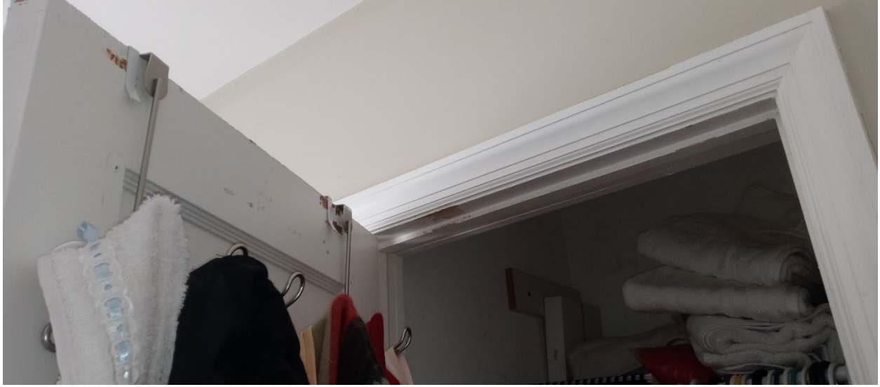
Bedroom 2 Closet Door & Door Jamb