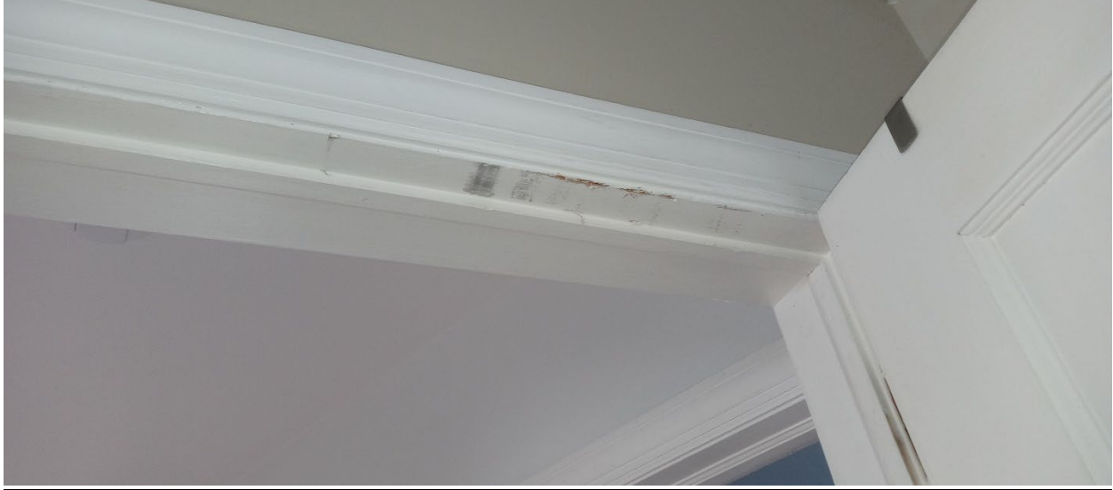
Bedroom 2 Door Jamb