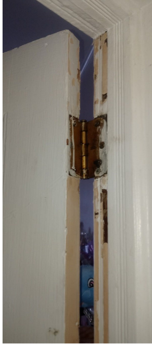
Bedroom 1 Door Jamb