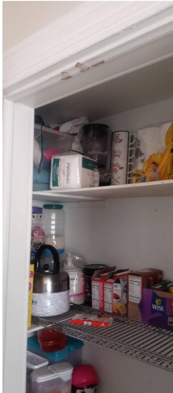
Kitchen Closet Door Jamb