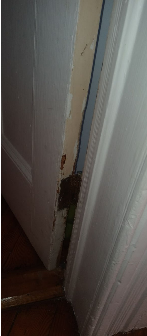
Bedroom 1 Door Jamb in Wall C