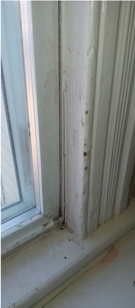
Living Room Window Casing