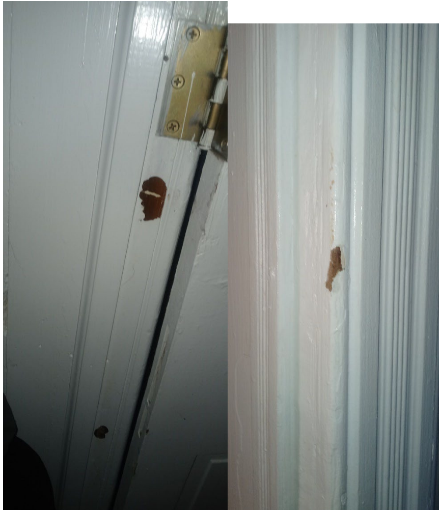
Living Room Door and Door Jamb in Wall D