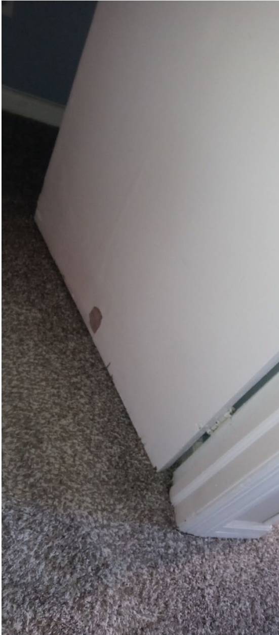
Attic Bedroom 1 Door