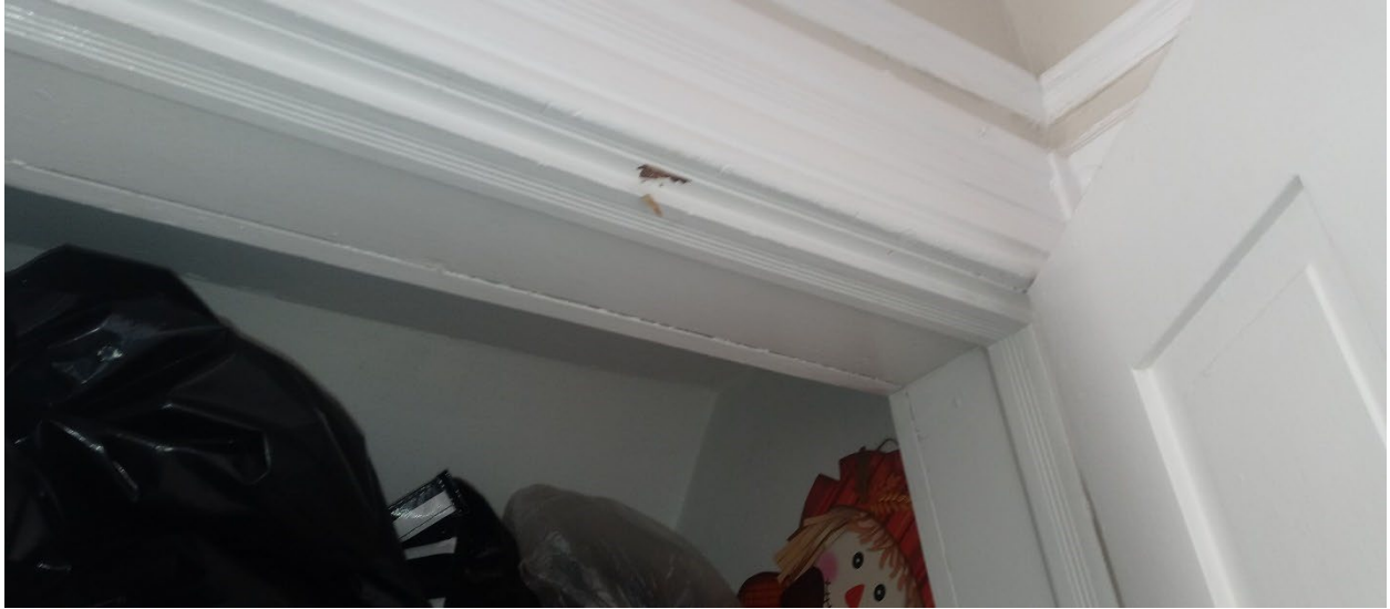
Bedroom 1 Closet Door Jamb