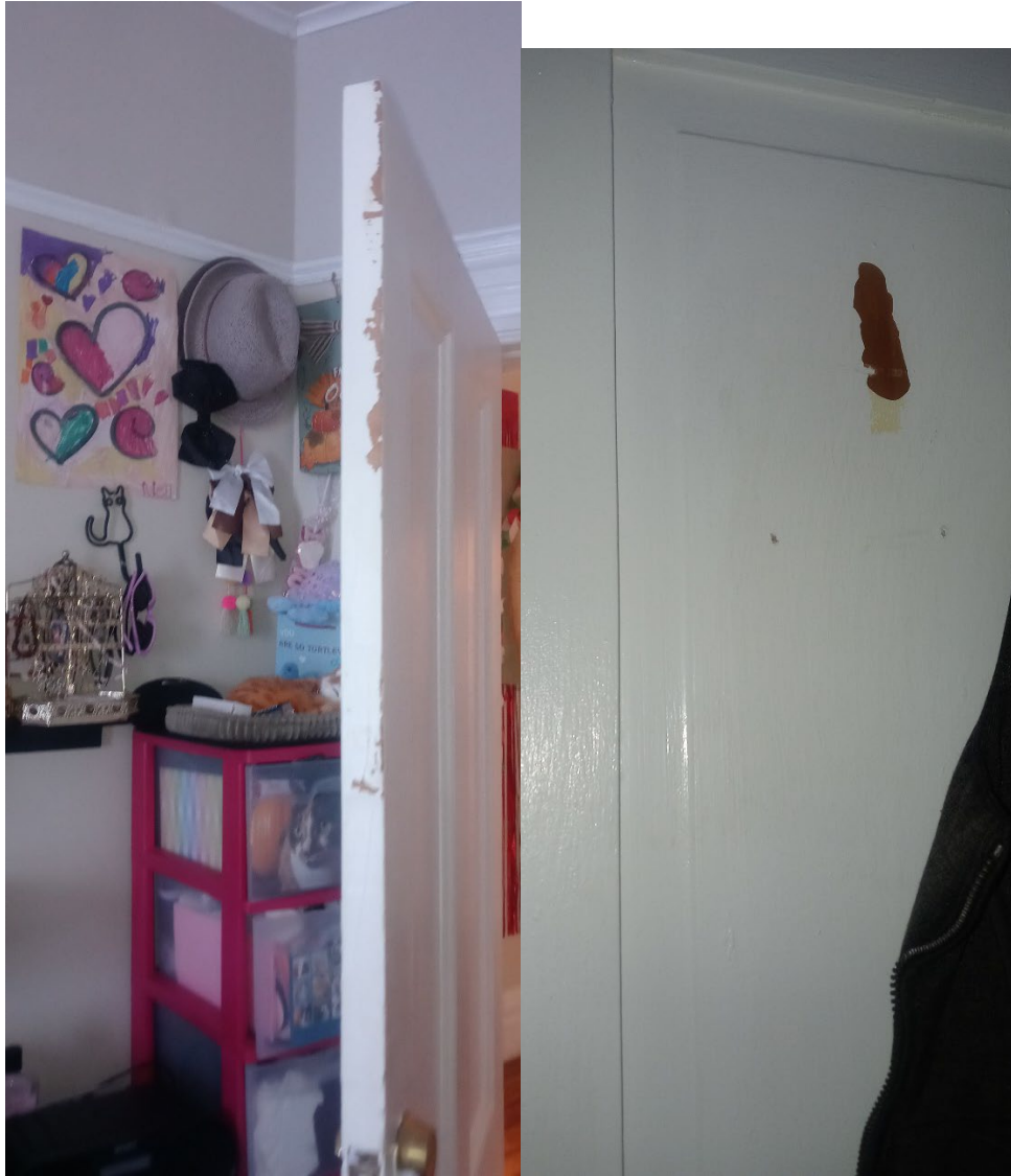
Bedroom 1 Door in Wall C