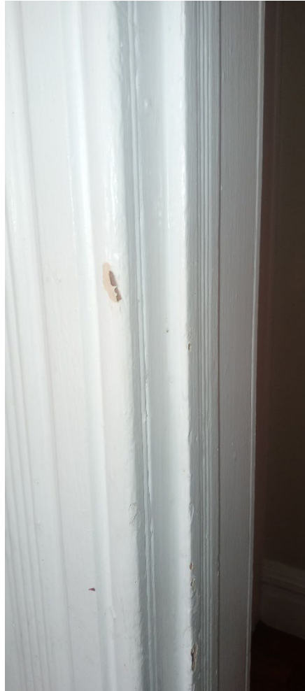
Kitchen Door Casing