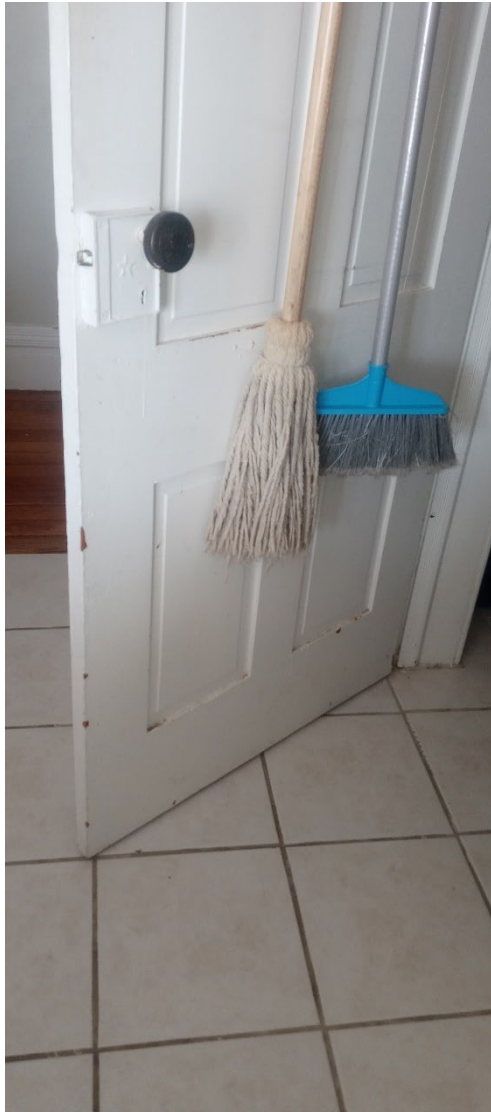
Kitchen Closet Door