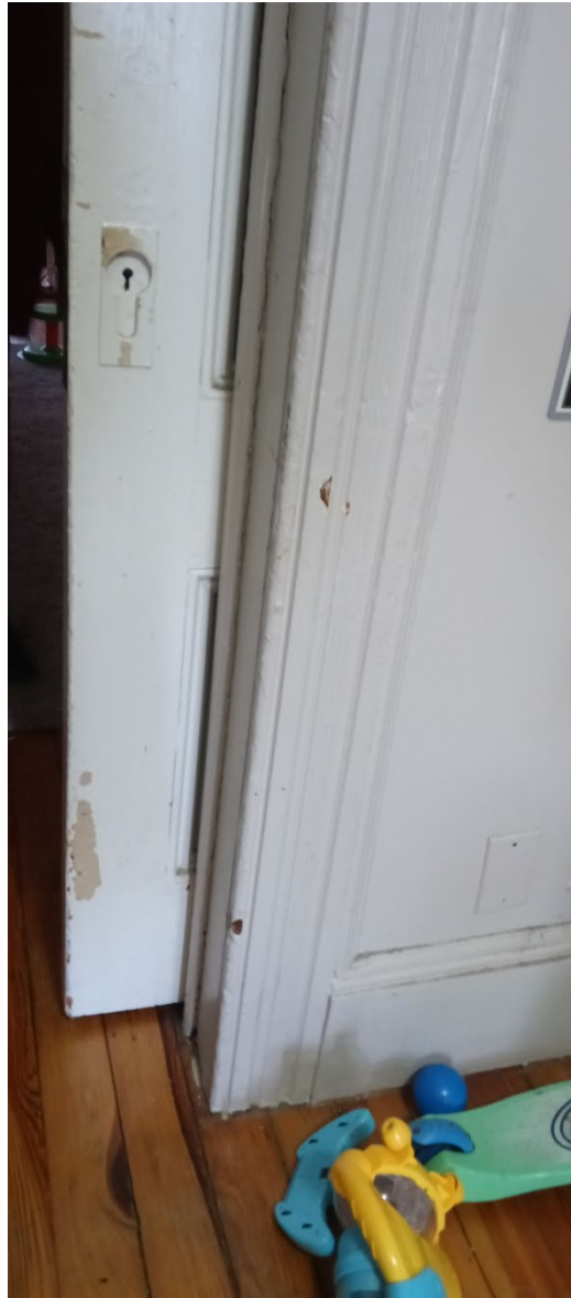
Living Room Door Casing