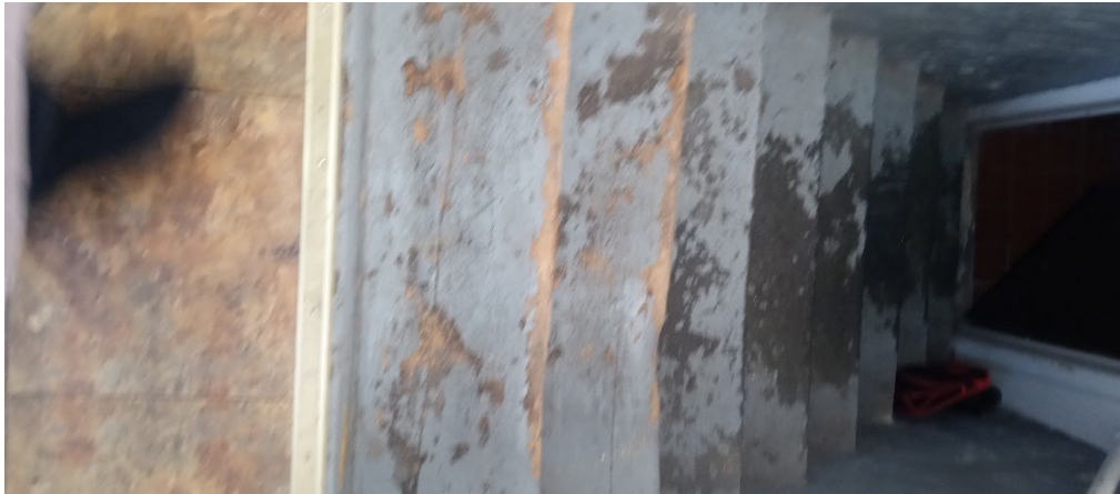
Rear Entry Stair Treads