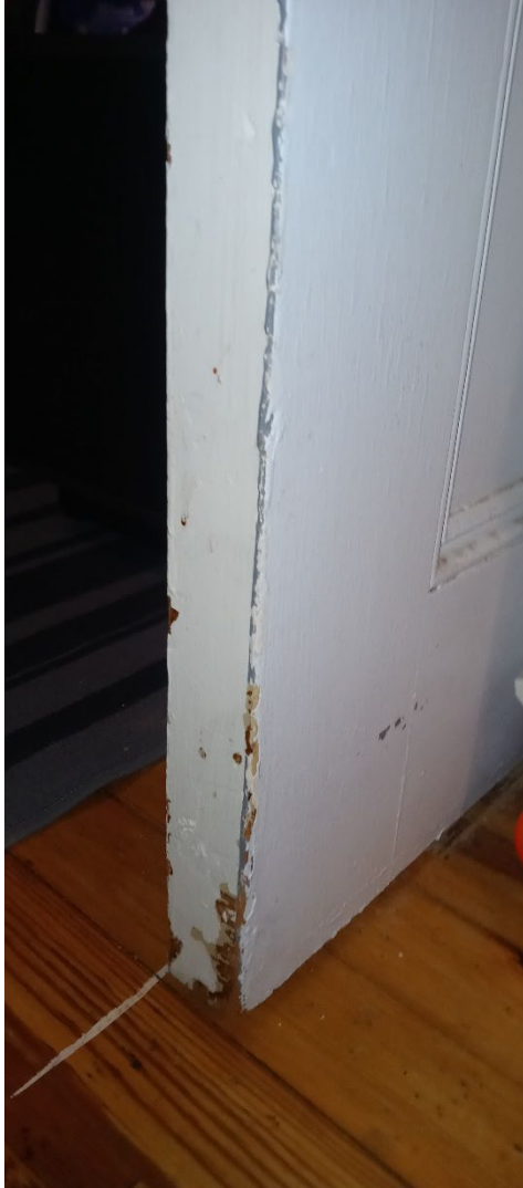
Living Room Door