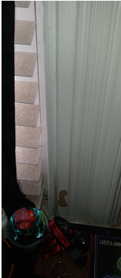
Bedroom 1 Window Casings