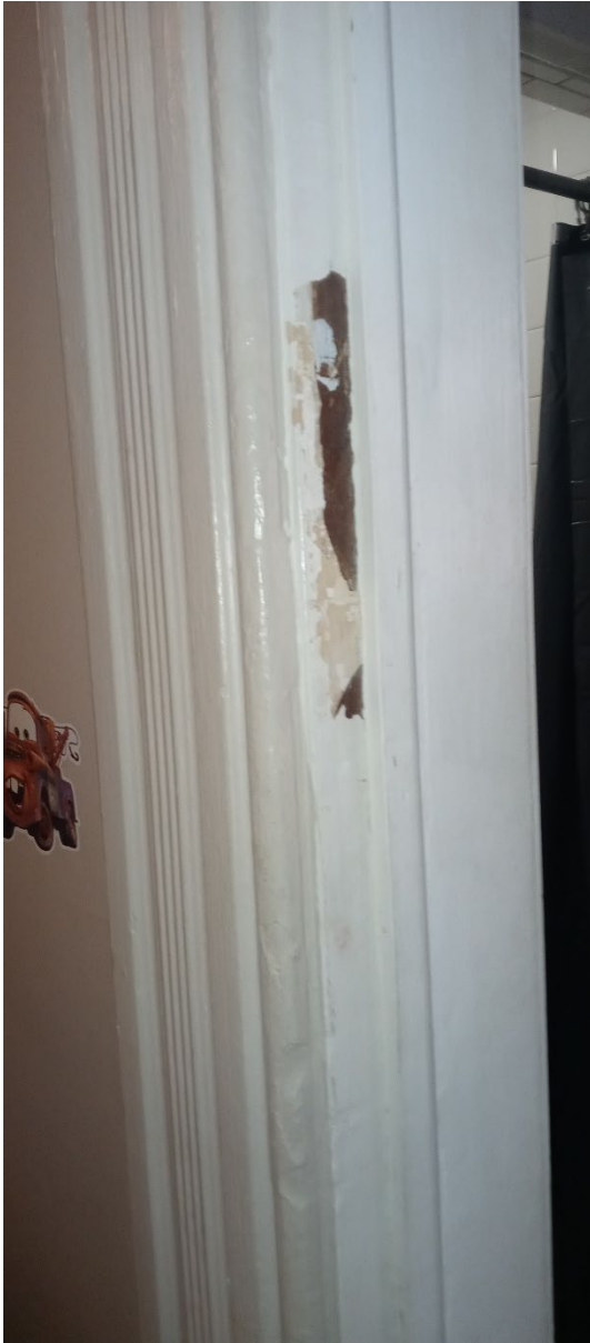
Bathroom Door Jamb