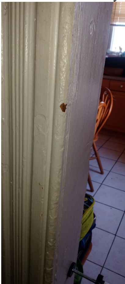
Kitchen Door Casing