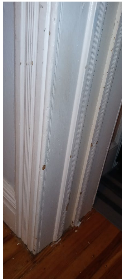
Bedroom 1 Door Casing Wall D to Hallway