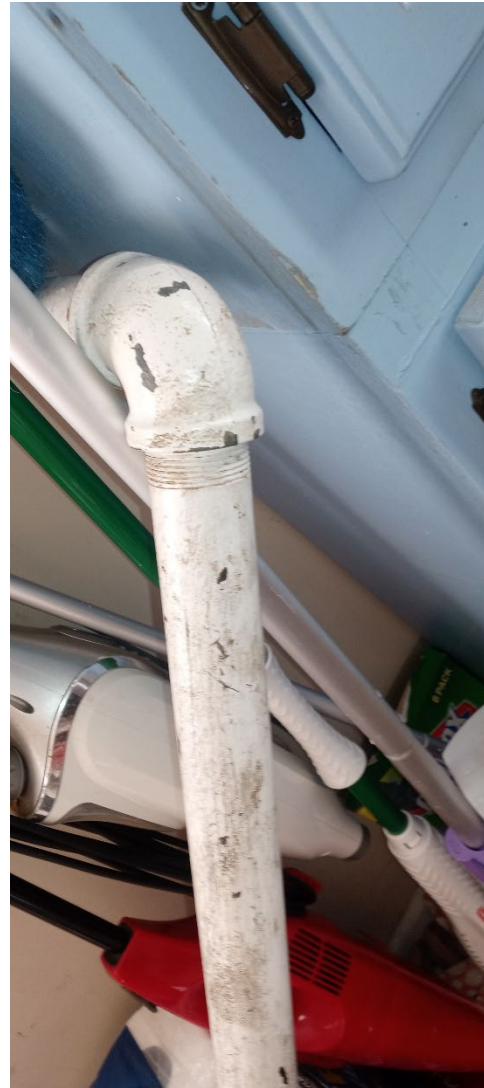
Rear Entry Stair Railing