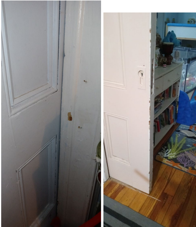
Bedroom 2 Door and Door Casing in Wall A