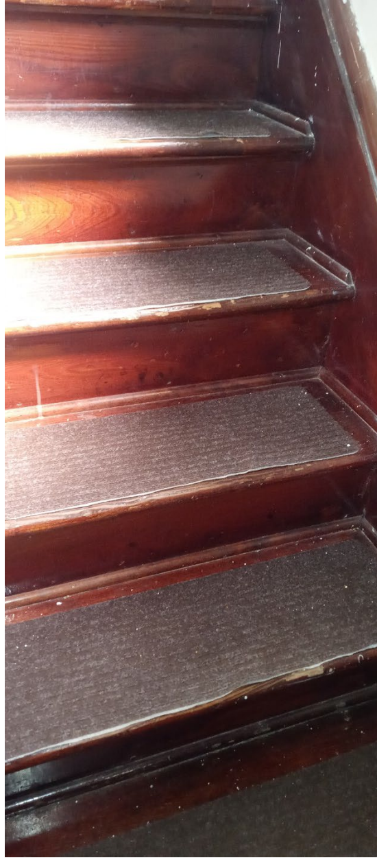
Foyer stair treads