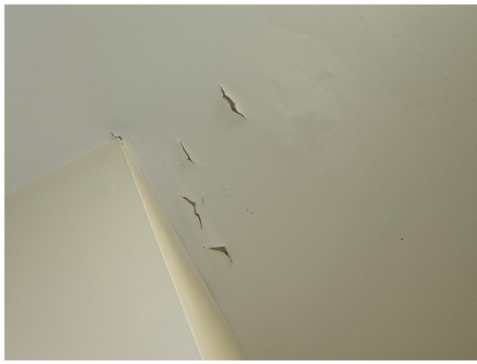
Hazard: Foyer/Hall | Ceiling | Deteriorated Paint

Lew Environmental Services - 181 Jacoby Street -Visual Inspection Prepared By: LEW Environmental Services, LLC 07/01/2024