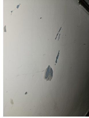
Hazard: Foyer/Hall | Wall | Deteriorated Paint