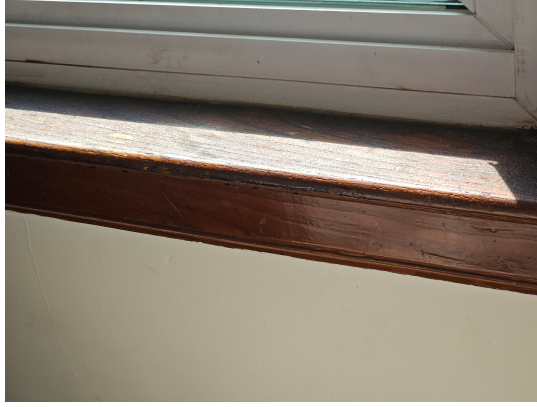
Hazard: All Rooms | Window sills | Dust