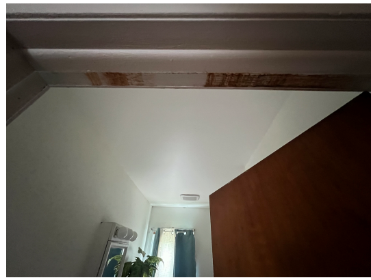
Hazard: Bathroom 1 | Door Casing | Deteriorated Paint