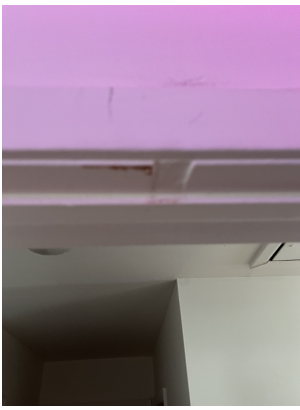
Hazard: Bedroom 1 | Door Casing | Deteriorated Paint