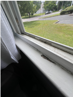
Hazard: Bathroom 1 | Window Sill | Deteriorated Paint