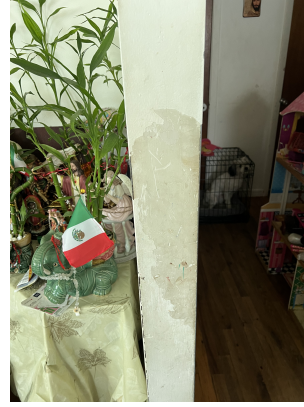
Hazard: Living Room | Wall | Deteriorated Paint