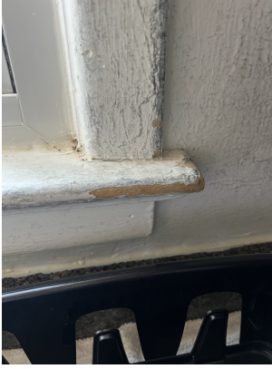
Hazard: Kitchen | Window Sill | Deteriorated Paint