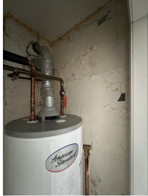
Hazard: Utility Closet | Wall | Deteriorated Paint

Lew Environmental Services - 10 First Street, Flagtown - Visual Inspection Prepared By: LEW Environmental Services, LLC 01/30/2024