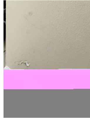
Hazard: Living Room | Wall | Deteriorated Paint Hazard: Living Room | Wall | Deteriorated Paint

Low Environmental Services - 10 First Street Flagtown -Visual Inspection